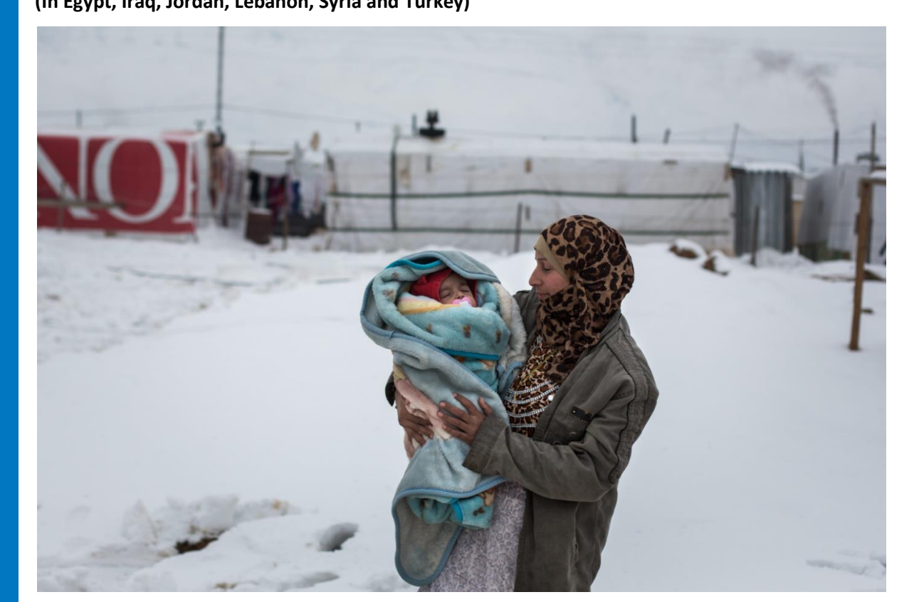
Lebanon, 4 month year old baby and mother from Syrian refugee camp in Bekaa Valley, on 10 January 2015.

UNHCR Regional Winter Progress Report: Syria and Iraq Situation 1 Sep - 1 October 2015 (In Egypt, Iraq, Jordan, Lebanon, Syria and Turkey)