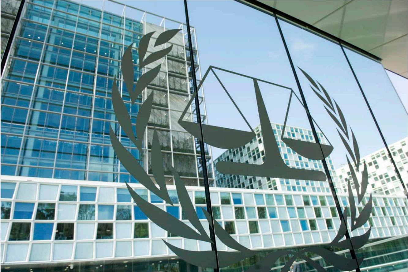
Permanent Premises of the International Criminal Court, 2016.

It has stressed the need to end impunity by bringing perpetrators to justice, emphasized the importance of prompt, transparent and comprehensive independent and/or impartial investigations, and recalled that violations of applicable international law may amount to war crimes. 294 It has focused significantly on the promotion of accountability through international mechanisms , highlighting the importance of strengthening international investigations and cross-border judicial cooperation in identifying and prosecuting perpetrators, welcoming the establishment of international commissions of inquiry, and promoting cooperation