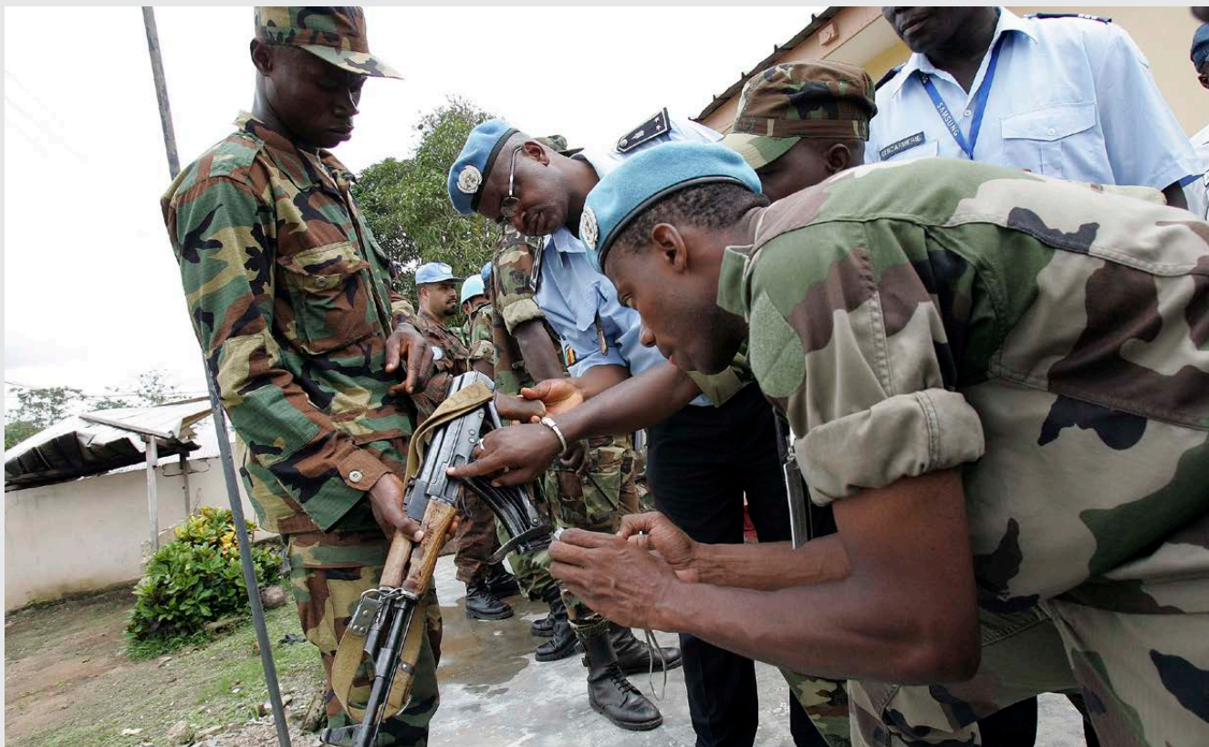
Peacekeepers conduct arms embargo inspections on Government forces in western Côte d'Ivoire, 2005.