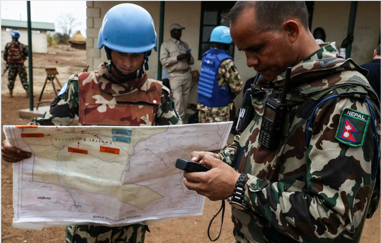
South Sudan integrated team visits site of recent attack on aid workers, 2017.

ing to Secretariat policy, public reporting on human rights, with several missions mandated expressly by the Council to monitor and report on threats to civilians and/or violations of IHL or human rights violations and abuses. 280 Four UN peacekeeping op-