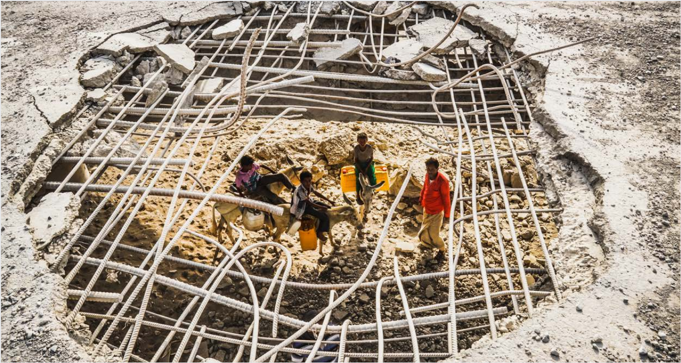
Al Hudaydah, Hajjah Road Bridge, Yemen, 2017. A man and his sons travel to collect water underneath a bridge that was hit by an airstrike in 2016.

Over the past two decades, a number of key themes have emerged in the Council's work on PoC, which have coincided to some degree with the themes and priorities identified in the Secretary-General's PoC Reports. They include (A.) enhancing respect for international law in the conduct of hostilities, (B.) facilitating access to humanitarian assistance and medical care, (C.) preventing and responding to forced displacement, (D.) according special protection to children affected by armed conflict and (E.) protecting women and combatting conflict-related sexual violence (CRSV).