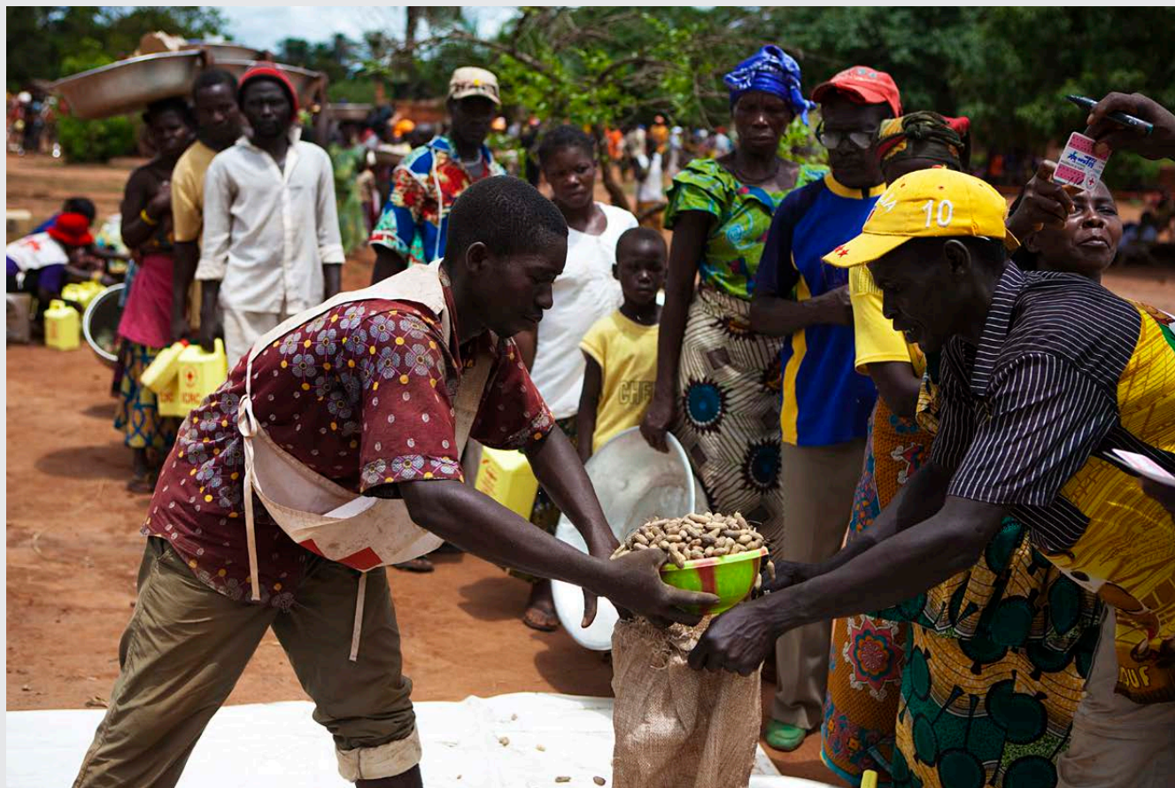
Humanitarian aid delivery in Haut Mbomou province, town of Obo, Central African Republic, 2010.

tack on the UN headquarters in Baghdad in 2003 and to a period marked by particularly high casualties among humanitarian workers in 2014 by adopting two dedicated thematic resolutions on the protection of UN and humanitarian personnel. 80