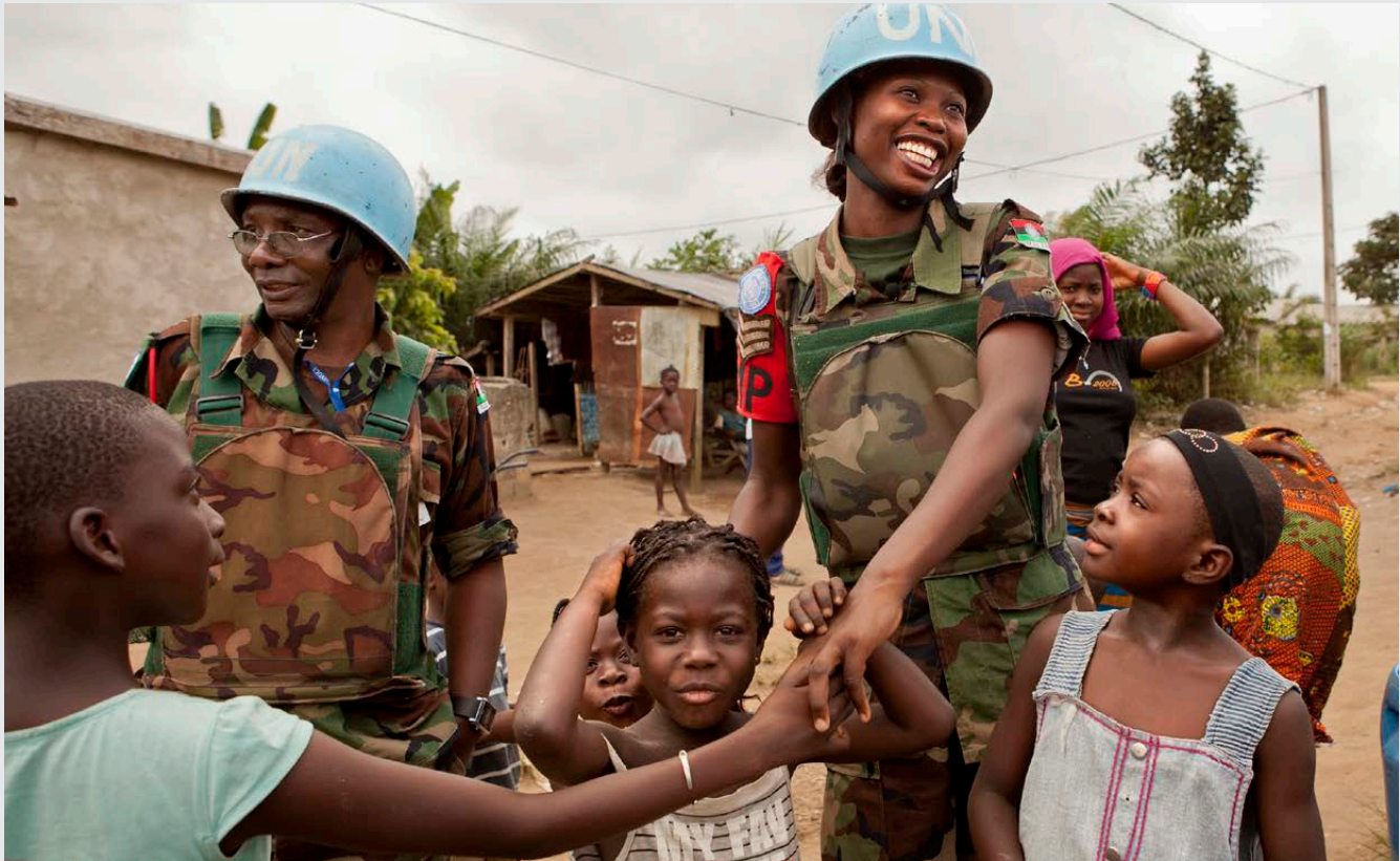
Malawian peacekeepers serving with the UN Operation in Côte d'Ivoire (UNOCI) greet children while on patrol, 2012.