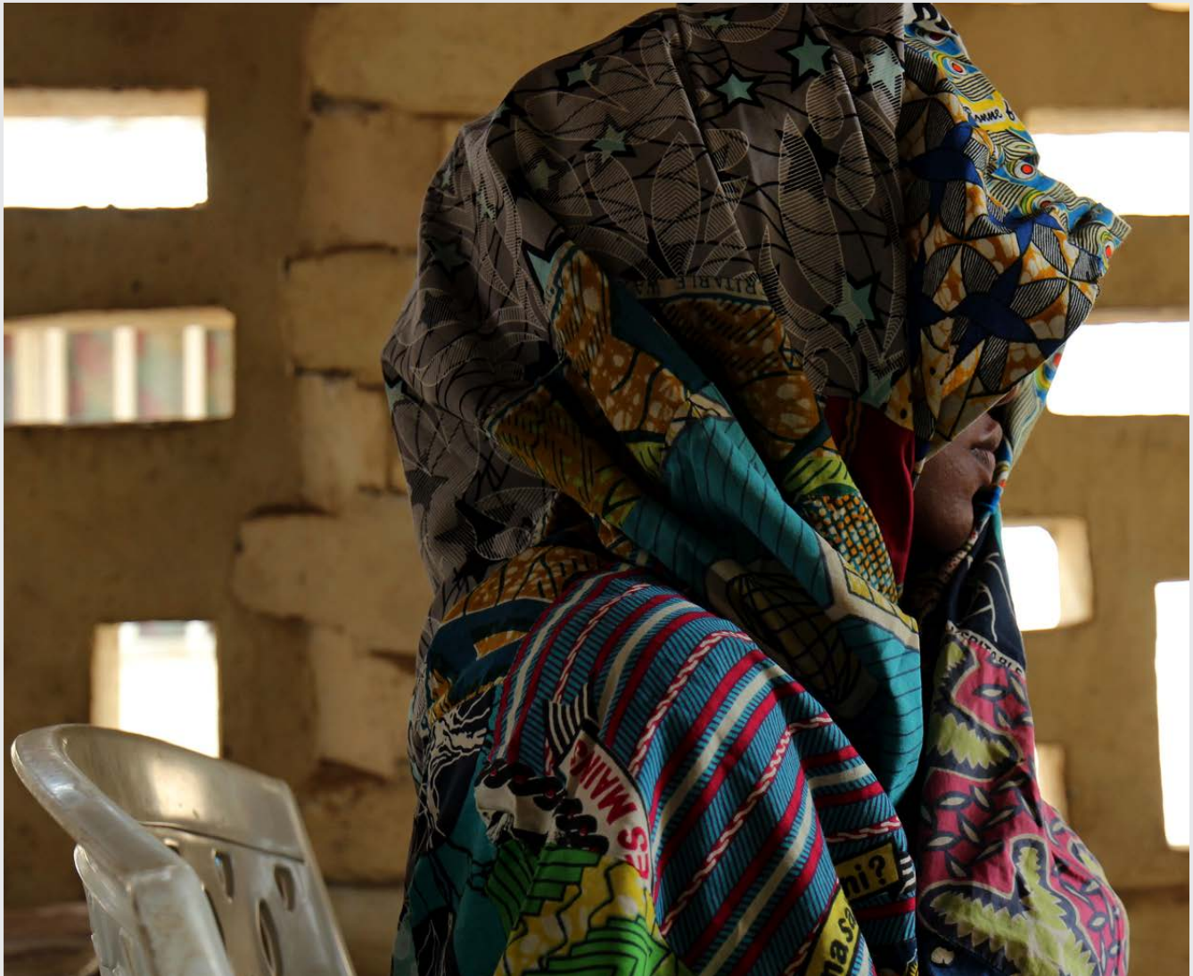
Hundreds of women have been raped in Kasai, a central DRC region struck by violence since August 2016.

GBV sub-cluster, gender theme groups, and the GBV Information Management System (GBV-IMS). 165 It is informed by UN entities, relevant institutional bodies, NGOs and civil society or-