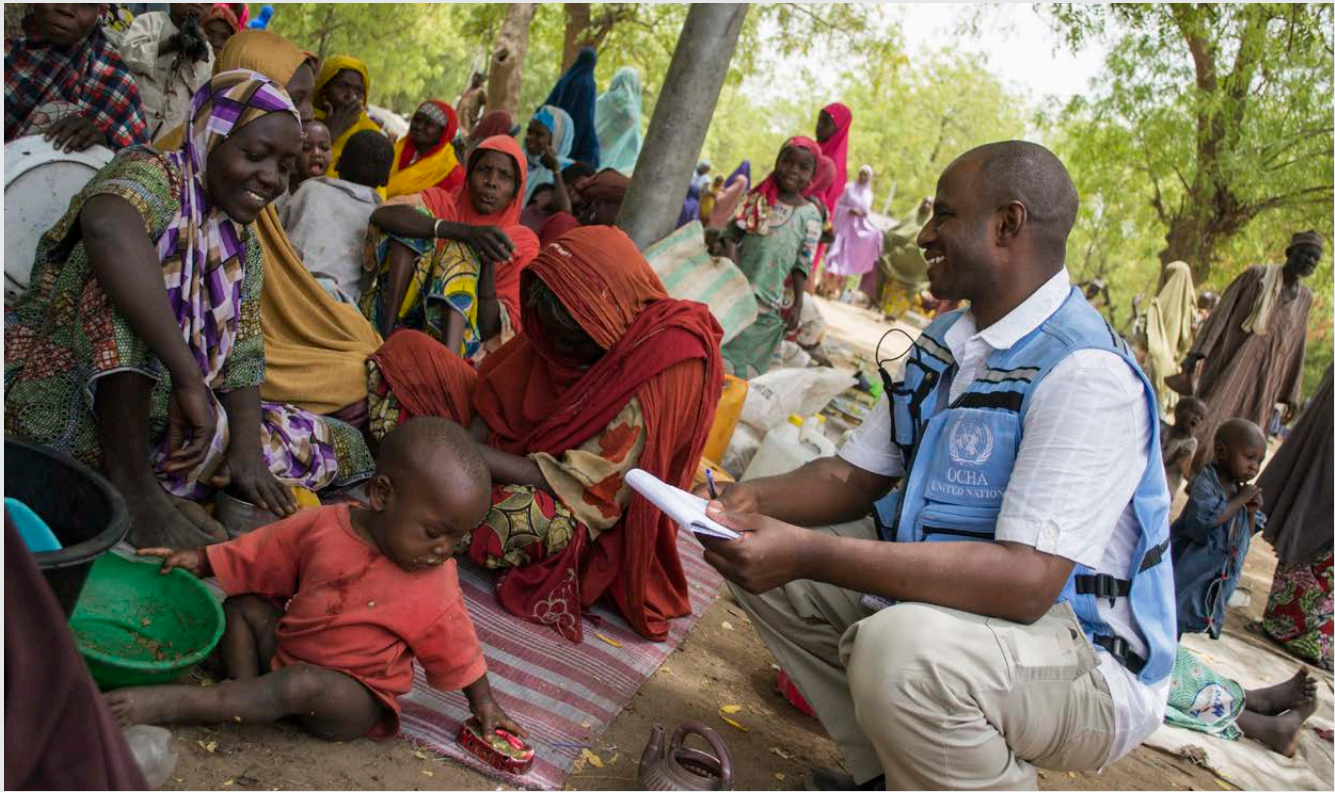
IDP camp, Bama town, Borno State, Nigeria, 2018.

has also emphasized the need to ensure and respect the civilian character and security of refugee and IDP camps or PoC sites and made reference to the Guiding Principles of Internal Displacement (the Guiding Principles) and the Kampala Convention. 129 To implement the protection of refugees and IDPs, the Council has increasingly included corresponding provisions in the mandates of UN peace operations. Peace operations have been mandated to ensure the civilian character or security of refugee and IDP camps or PoC sites or to proactively deploy to and conduct active patrolling in areas of high concentration of IDPs and refugees. 130 They have also been cautioned to pay particular attention to the