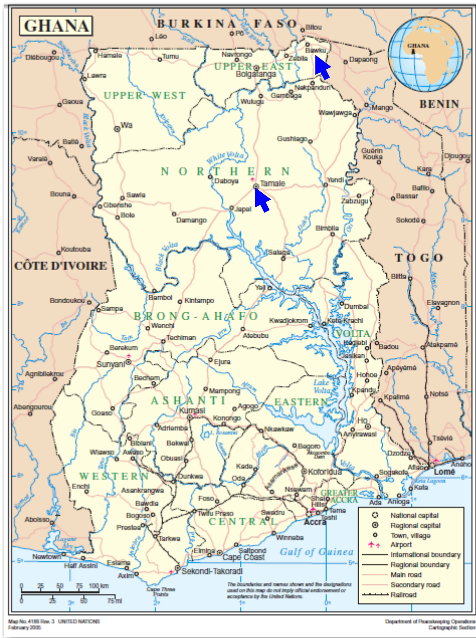
Map 3: Ghana with Tamale and Bawku marked

The third-largest city in Ghana and the biggest in the north-west, Tamale is reportedly a “commercial capital” for all three of the northern regions – that is, the Northern, Upper West and Upper East Regions. 115 It is in Dagomba territory and remains strongly Dagomba: over 80 per cent of the metropolis’s population come from this group. 116 (For