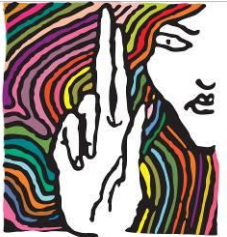
Hungarian Helsinki Committee