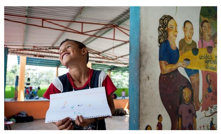
Mexico. Families find safety in UNHCR funded shelters.

Following the increase displacement, a supplementary appeal was issued in June 2016, outlining UNHCR's protection and solutions interventions in the region in favor of refugees, asylum-seekers and IDPs from the NTCA. Additional resources received helped at strengthening protection, communitychild protection based areas, increasing monitoring and protection networks capacity, reinforcing reception centres, and protection responses for cases at risk in the NTCA. Resources were also dedicated