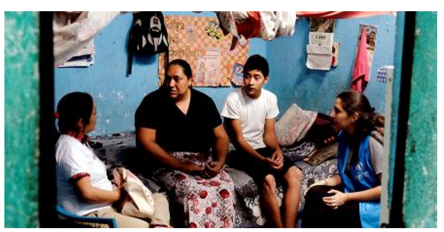
Guatemala. UNHCR along The Migrant House work on the project Children of Peace.