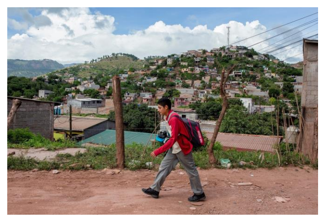
A student walks home from school in the community of La Era in Tegucigalpa, Honduras.

This includes the provision of services, such as legal and psychosocial support and child friendly spaces in strategic areas of the country.