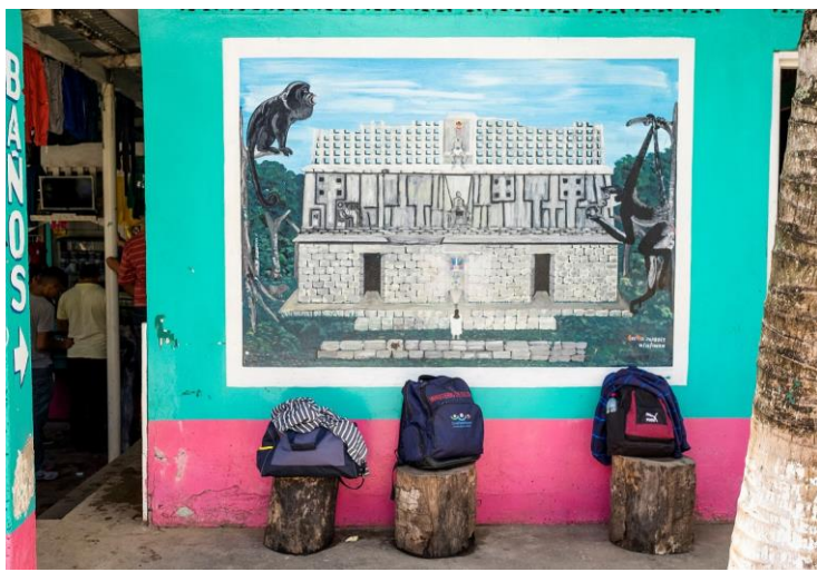
Backpacks of refugees sit by a local store in the Guatemala town of La Técnica as they await for a chance to cross to Mexico.