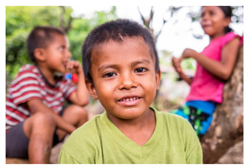
Guatemala. Mexican border town popular with refugees

UNHCR is providing support to Governments (Mexico, Costa Rica Panama) in the implementation of the Quality Asylum Programme (QAI), aimed at enhancing the auality of status determination procedures and strengthening the capacity of national refugee institutions. Within QAI framework, UNHCR Costa Rica carried out a series of of country origin information visits to El Salvador and