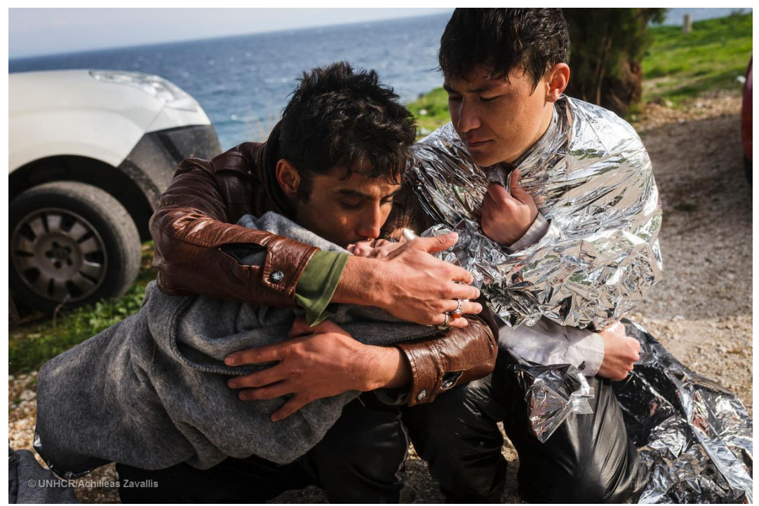
A young man from Afghanistan tries to keep his six month old baby warm shortly after reaching the shores of Lesbos, Greece, December 2015.

As of 27 January 2016, 257 individuals were relocated out of Italy and 157 out of Greece, totaling 414 persons relocated so far to 11 Member States. In terms of places pledged, 16 Member States and Lichtenstein have offered relocation places.