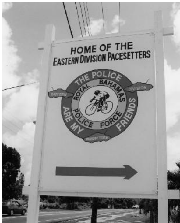
Sign outside the Elizabeth Estates Police Station, New Providence. RBPF strategy is to increase community police liaison. However reports of ill-treatment in custody are still received.

The lack of public confidence in the independence, transparency and accountability of the current system for investigating complaints against the police was acknowledged in a recent review of the police commissioned by Government and in Amnesty International's meeting with the Minister of National Security. At present civilian oversight of complaints against the police still appears to be lacking. Complaints are investigated by the Police Complaints and Corruption Branch, which reports directly to the Deputy Commissioner of Police. 125 This unit determines if enough evidence of abuse or misconduct exists in a particular case to warrant disciplinary action or criminal prosecution. Four civilians were reportedly appointed to the body in December 2002.