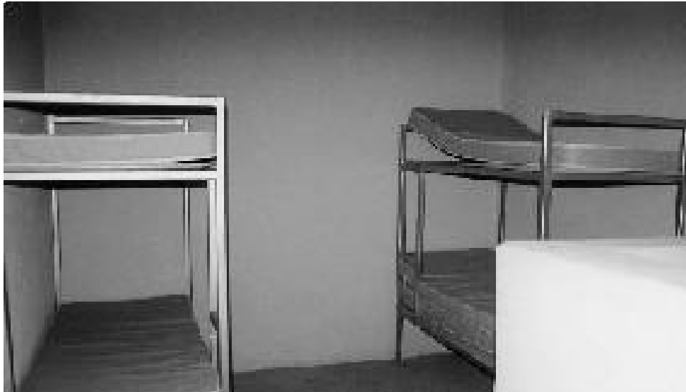
Cell in the newly constructed remand centre.

prisoners awaiting trial. Amnesty International also interviewed a number of lawyers who expressed concerns about gaining access to their clients.