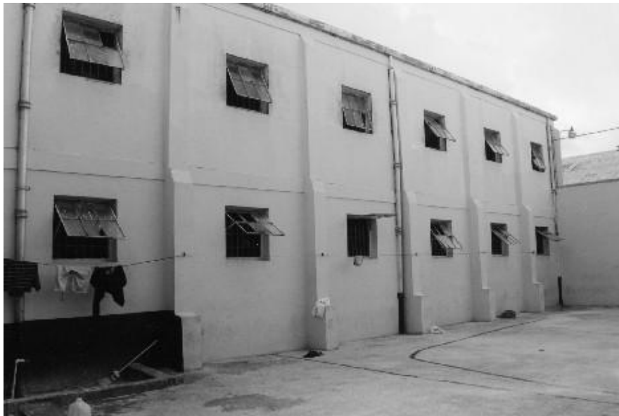
Exercise yard. Permission to use the yard may be cancelled in the case of bad Weather. Female prisoners told Amnesty International that they were denied the right to exercise at all.

It should be noted that the Prison Staff Association said that exercise could be provided on the other three days a week but that management had failed adequately to discuss the proposition with staff. They also claimed that the lack of medical cover meant that staff got inadequate medical treatment, exacerbating staff absenteeism. The latter assertion was ridiculed by the Ministry of Health and Ministry of Security officials, who said that staff abused sickness absenteeism and that many viewed the 28 days sickness absence permitted per annum as an entitlement.