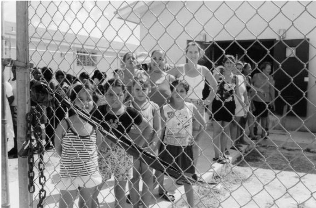
Children detained alongside female detainees line up for roll call. Contact with male relatives in adjoining huts is prohibited. The huts are separated by a barbed wire fence.