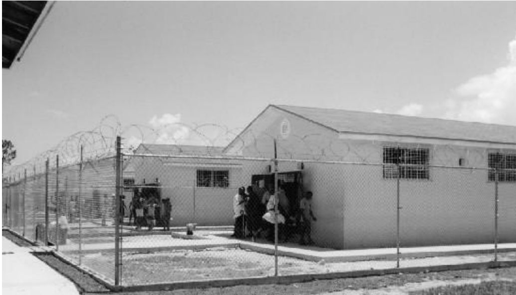
Photo of huts at Carmichael Detention Centre surrounded by internal barbed wire fence.