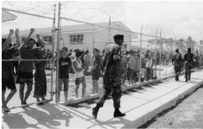
Soldiers patrol the inside of the Carmichael Detention Centre.