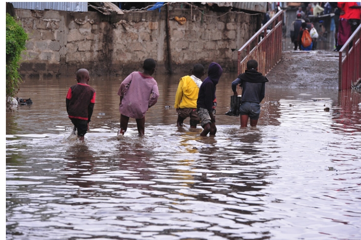
Residents of Mukuru Kwa Njega slum waded through water following heavy rainfall in Nairobi, Kenya. The 2015 El Nino in Kenya was the most severe in 15 years.