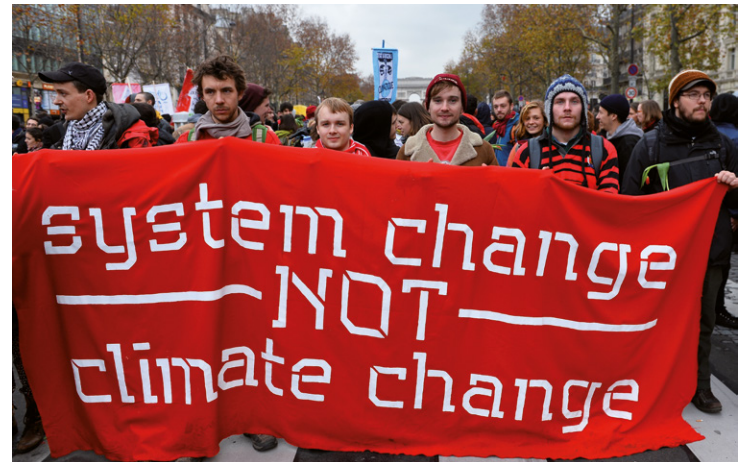
Protestors, during the United Nations conference on climate change in Paris in 2015, made their opinions clear that it was time to take serious action to curb emissions of the greenhouse gases that threaten to wreak havoc on the earth's climate.

National legislation and international agreements are mutually reinforcing. Ahead of the 2015 Paris climate change negotiations, national legislation helped to create the conditions for a more ambitious international