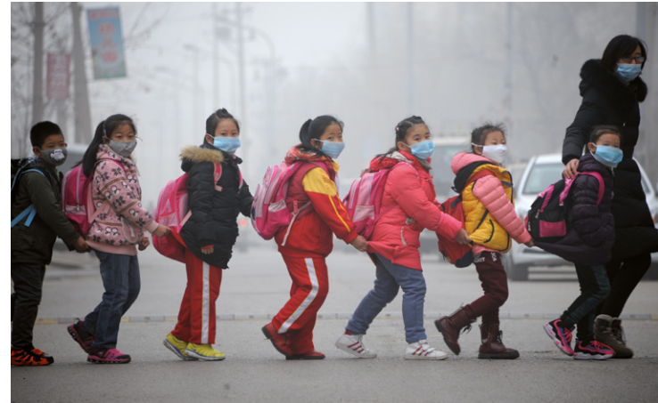
Chinese students wear masks against heavy smog in Jinan City, in east China. China pledged to reduce toxic emissions from coal-burning factories during the COP21 Climate Conference in Paris.

Action area 2 Accelerating the ratification and implementation of the Doha Amendment to the Kyoto Protocol and promoting rapid ratification, acceptance, approval or accession of the Paris Agreement by the end of June 2018 at the latest.