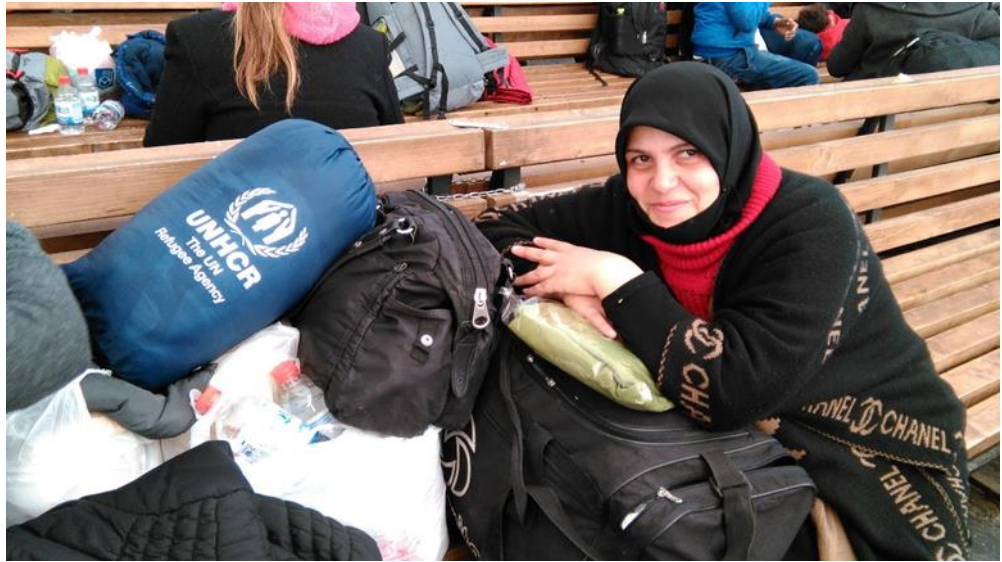
A refugee received a new UNHCR sleeping bag in Vinojug reception centre, former Yougoslav Republic of Macedonia, January 2016.

As of 10 February 2016, 497 persons relocated so far to 12 Member States (279 individuals were relocated out of Italy and 218 out of Greece). In terms of places pledged, 17 Member States and Lichtenstein have offered relocation places.