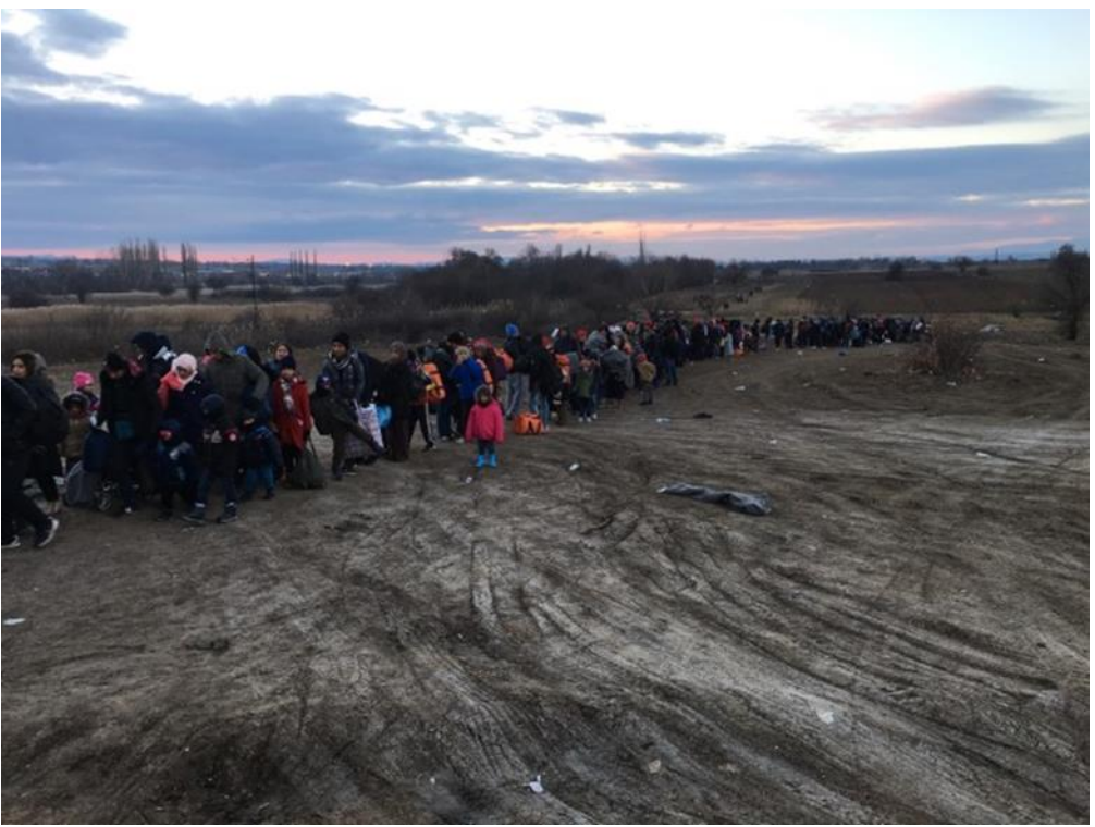
Long queue for luggage scan, Miratovac (Serbia), February 2016.

As of 16 February 2016, 288 individuals were relocated out of Italy to eight Member States and 295 out of Greece, totaling 583 persons relocated so far to 14 Member States. In terms of places pledged, 20 Member States and Lichtenstein have offered relocation places.