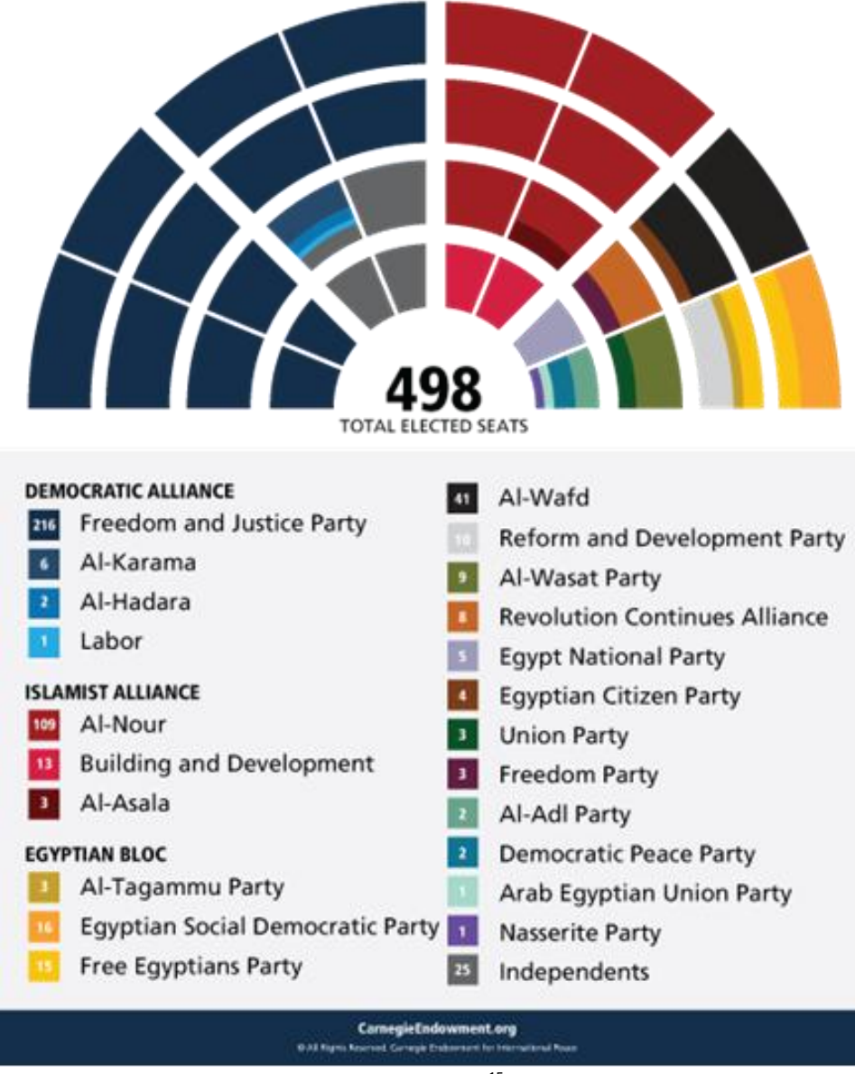
Figure 1: Seats in Egypt's People's Assembly 2012.<sup>15</sup>