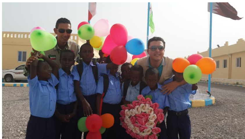
UNHCR and Al-Rahma staff during the official launch of the school year, August 2015.