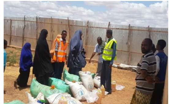
Somali returnees from Yemen receiving return package at Luuq Way Station

■ Djibouti: According to statistics from IOM and the Government, as of 31 August, some 24,176 people arrived since the beginning of the conflict: 11,354 Yemeni nationals, 10,968 transiting Third Country Nationals (TCNs) and 1,854 Djiboutian returnees. Five boats arrived at Obock port carrying 443 passengers: 380 Yemenis and 63 TCNs. UNHCR and ONARS registered 99 individuals. As of 30 August, UNHCR registered 2,603 refugees in Obock, among them 1,967 from Yemen. Arrivals in Moulhoulé and Gor-Angar (north of Obock) increased as boats lack fuel to reach Obock port: the majority of arrivals come from Bab-El-Mandeb and Dubab.