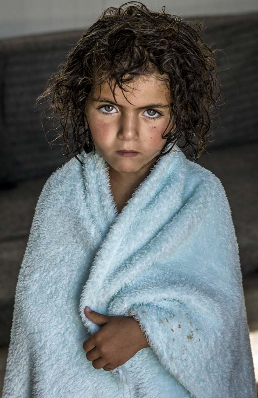
Portrait of a young Syrian refugee taken in her mobile home in the Za'atari refugee camp in Jordan.