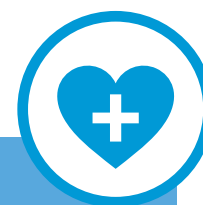
Table 1. A health worker student competent to provide services for women subjected to violence: