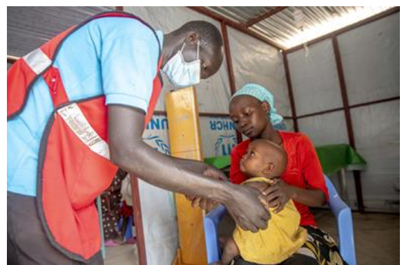
In Kakuma, UNHCR works with partners to support continued screening and refers children at malnutrition risk to nutrition clinics.

PoCs were successfully enrolled into National Hospital Insurance