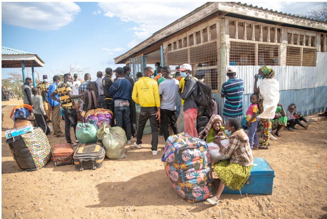
Burundian refugees queuing to check in at the Kakuma Airstrip. plane that will be taking them home to Burundi from Kakuma Refugee Camp.