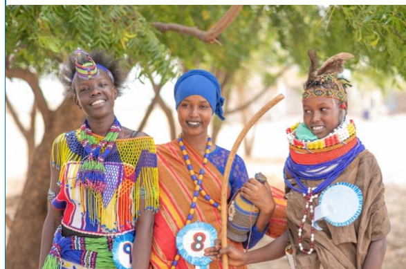
Learners from LifeWorks Boarding school for girls in secondary level in Kakuma displaying their traditional attires during a cultural day held at the school.

Cumulative number of confirmed COVID-19 positive cases In Kakuma