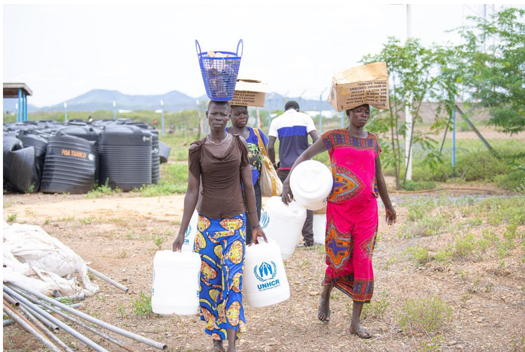
In September and August, UNHCR disbursed cash to 35,144 (52% female-headed households) households in Kalobeyei settlement to purchase Core Relief items.