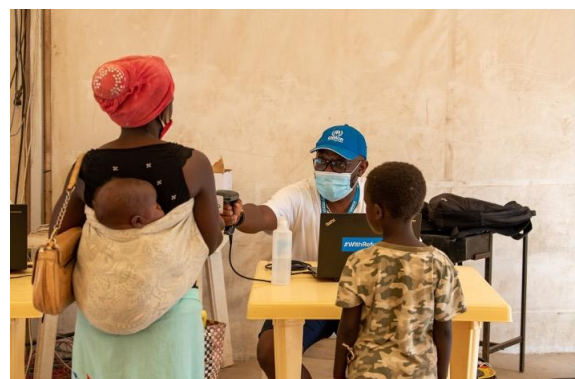
UNHCR staff during a continuous registration activity. In September, UNHCR partnered with the Civil Register for Turkana West to offer 278 birth certificates to refugee children in Kakuma.

Cumulative number of confirmed COVID-19 positive cases in Kakuma