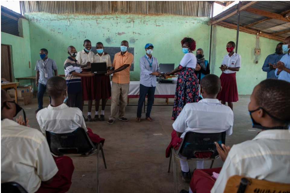
UNHCR's Head of Sub Office and the Sub County Director for Education, Turkana West Sub County, hands over ICT equipment to teachers and girls from Our Lady's Girls Secondary School in Kakuma town.