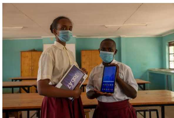
Learners (refugee and host) at Our Lady secondary school pose with tablets donated to the school by various donors through UNHCR.

Individuals received their second dose of COVID-19 vaccine in Kakuma