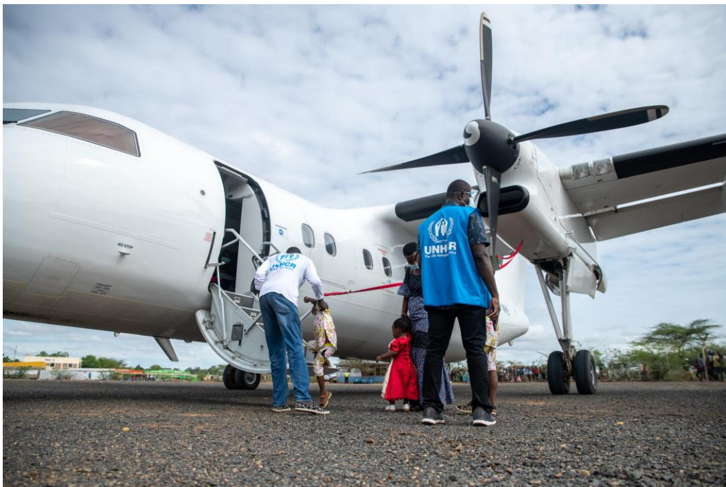
UNHCR staff helps a family board a plane at Kakuma airstrip. This is the first Voluntary Repatriation flight to Burundi in 2021. 72 individuals were facilitated to return on 27 April 2021.

On 27 April, UNHCR facilitated the return of 72 Burundian refugees and asylum seekers through UNHCR's Voluntary Repatriation Programme (VolRep).