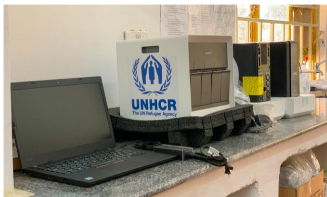
One of the two Gene-Xpert machines donated by UNHCR to support the fight against COVID-19 in Turkana County: Installed at Ammusait General Hospital in Kakuma and Lodwar Referral Hospital.

COVID-19 samples collected in 2021 mostly from Humanitarian workers