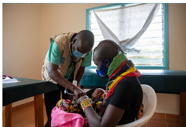
A member of the Turkana host community accesses health services at the newly inaugurated Locher Ang'amor clinic in Kakuma 1.

Cumulative confirmed COVID-19 cases among persons of concern and humanitarian workers in Kakuma.