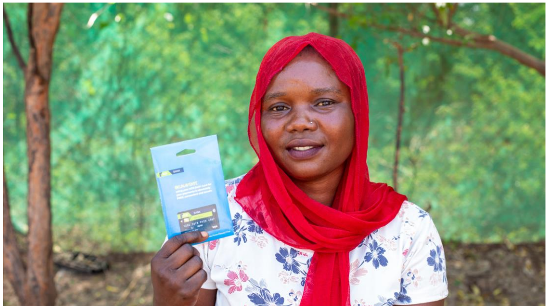
A refugee poses with a photo of her new ATM card received during the account opening and issuance of ATM activity by UNHCR and Kenya Commercial Bank in Kakuma.