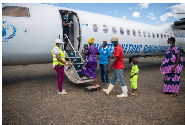
Persons of concern board a Voluntary Repatriation flight to Burundi at the Kakuma Airstrip. UNHCR facilitated repatriation of 69 individuals to Burundi in 2020.

Cumulative confirmed COVID-19 cases among persons of concern and humanitarian workers.