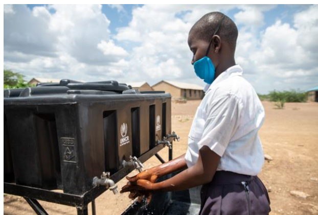
A learner from Arid Zone Primary School washes hands before accessing her classroom. As part of COVID-19 response, UNHCR has donated facemasks and handwashing stations to host community schools in Turkana West.

Cumulative COVID-19 tests conducted since the first case was recorded in May 2020