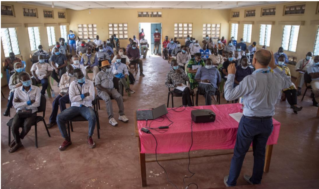
UNHCR Head of Sub Office Kakuma makes a presentation during the KISED P stake holders forum held in Kakuma town.

Stakeholders meet to take stock of progress made in the implementation of KISED P: On 2 October, representatives from the national and county governmental agencies, elected representatives, UNHCR and all KISED P stakeholders came together during a West Turkana stakeholder forum to take stock of milestones implemented under the KISED P approach. This included highlighting the most significant achievements under the eight thematic areas including health for the host communities in Turkana West. The COVID-19 pandemic was emphasised as to have disrupted the implementation of some of the flagship projects. The meeting took place at the Kakuma Youth Centre in Kakuma town under observance of Ministry of Health guidelines on prevention of the spread of COVID-19.