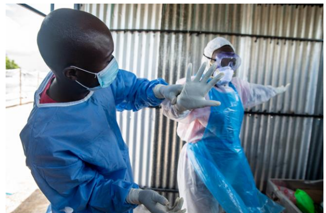
Medical staff put on (don) PPE at the COVID-19 Isolation and Treatment facility at the Nalemsokon Health facility.

Cumulative COVID-19 recoveries recorded as of 31 August 2020