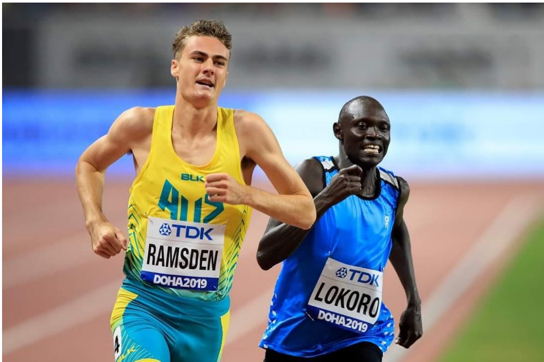
Paulo Amotun, refugee athlete from Kakuma, represents competes in the men's 1,500M race during the IAAF World Championships 2019 Doha.

https://www.iaaf.org/competitions/iaaf-world-championships/iaaf-world-athletics-championships-doha-2019-6033/results/men/1500-metres/heats/summary