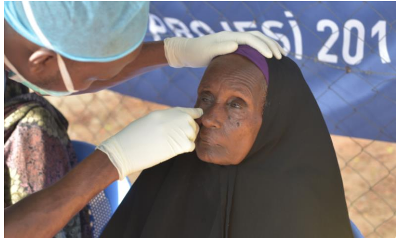
A doctor from TIKA checks on a patient, a day after surgery.