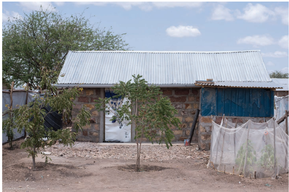
Photo of one of the over 1,200 permanent shelter constructed in Kalobeyei through CBI.

Transitional shelters in Kalobeyei Settlement