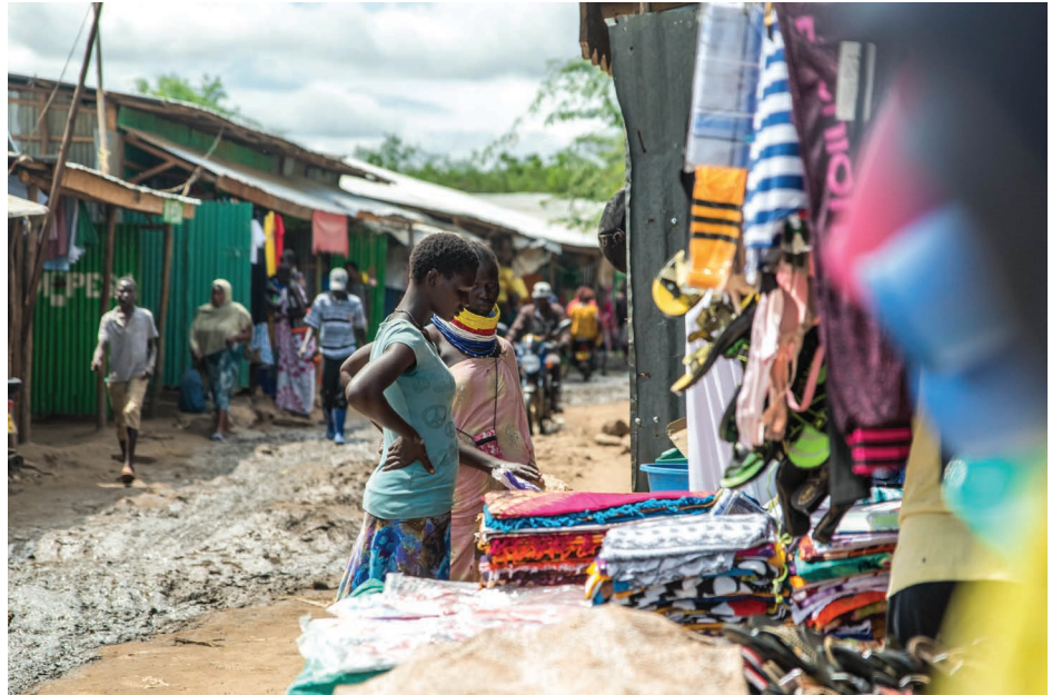
A busy section of a market in Kakuma 1. There are over 2,500 refugee owned businesses in Kakuma camp and Kalobeyei Settlement.

Village Loans and Savings Associations (VSLA) groups with a circulation of KSh.. 21.06 Million