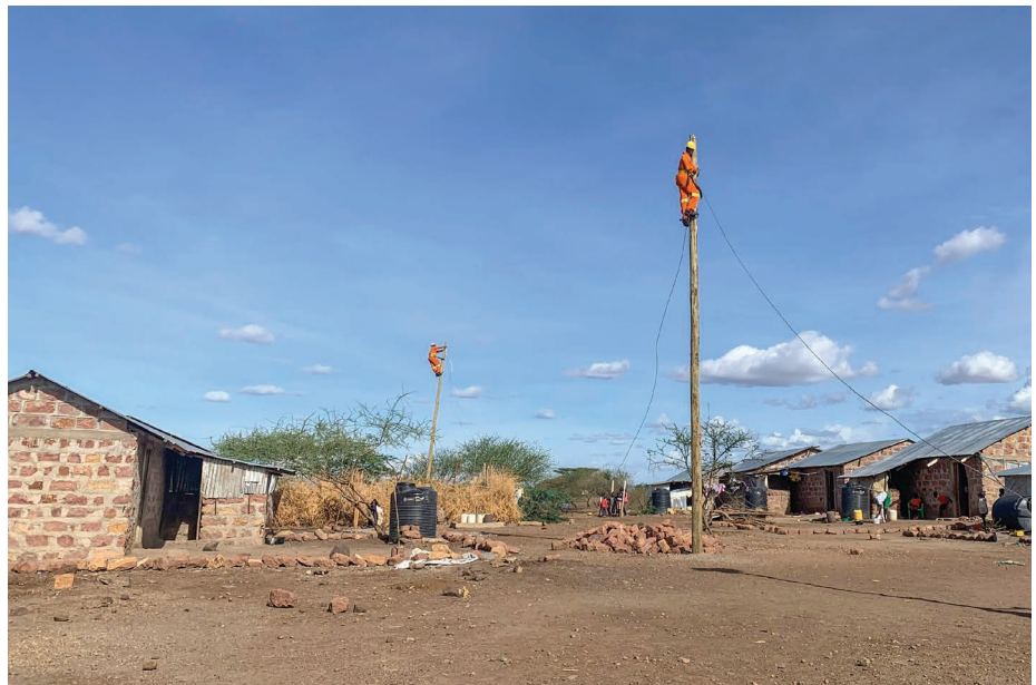
Installation of household distribution lines in Kalobeyei village 1 under the Kalobeyei solar-mini grid project by GIZ

Less fuel consumption as a result of solarisation of 9 boreholes