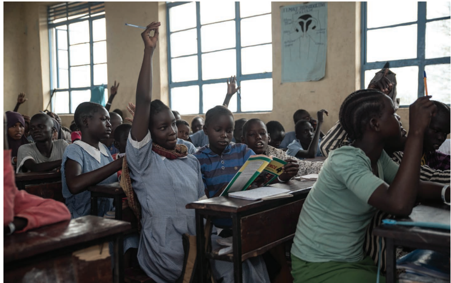
Refugee and host community children participate in class activities in Kalobeyei settlement

Gross enrollment in Kakuma camp and Kalobeyei settlement