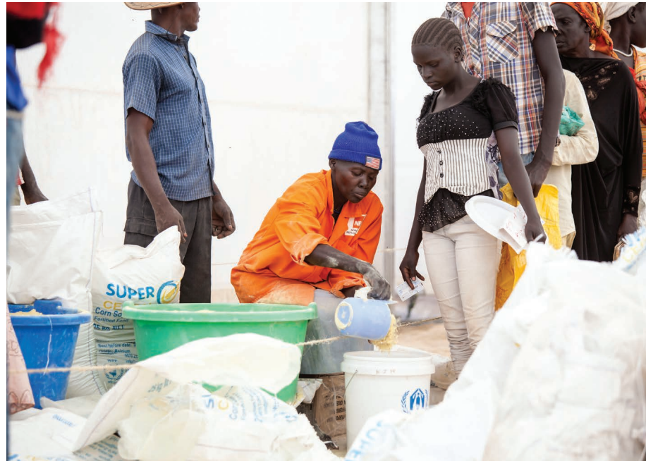
Refugees queue to receive supplementary food assistance provided by the World Food Programme (WFP)

Of in-kind food assistance is substituted for e-food voucher in Kakuma camp