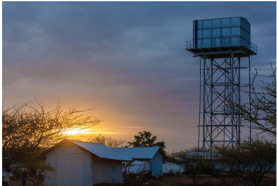
One of the 35 elevated steel tanks that provide clean water to residents of Kalobeyei settlement.

Number of communal pit latrines in Kalobeyei settlement