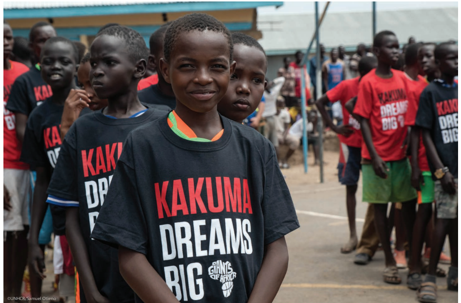
Refugees and host community take part in a basketball clinic dubbed 'Kakuma Dreams Big' organized by the Giants of Africa in Kakuma town.