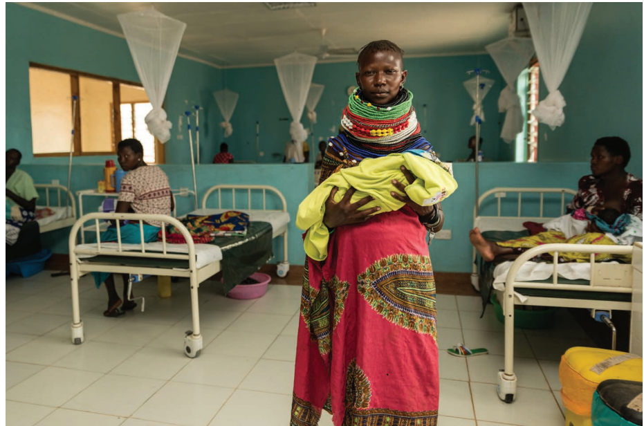
A Kenyan woman from the Turkana host community poses her newly born baby at Kalobeyei Health Clinic

Health facilities available in Kalobeyei Settlement