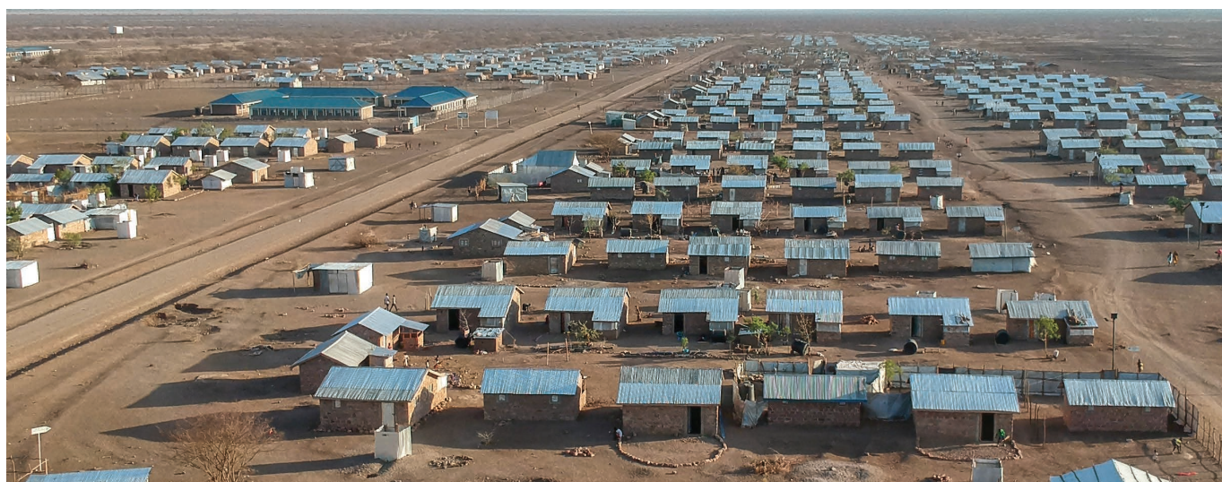
Photo: An aerial image of the over 2,000 permanent shelter units constructed in Village One of Kalobeyei Integrated Settlement.

Of refugees access the Internet using Smart phones