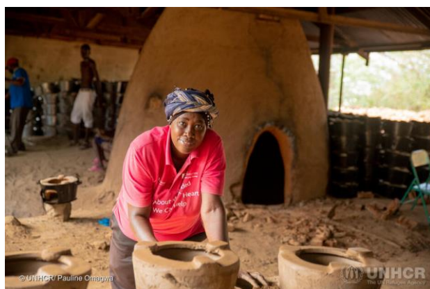
In Kakuma, refugees produce stoves that help combat climate change by reducing CO2 emissions and providing employment opportunities for refugee and host youth.

Refugees departed to various resettlement countries between 1 January to 31 August 2022