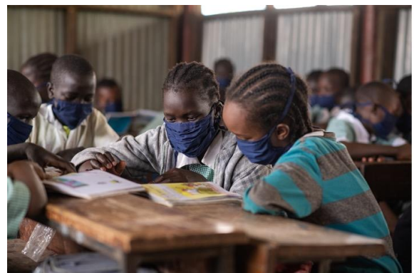
Two young girls share a textbook. Working with partners, UNHCR supports post-Covid-19 education recovery efforts, focusing on ensuring safe school operations and compensating for missed study time.

Number of individuals reactivated after re-establishing contact with Refugee Affairs Secretariat offices during continuous registration activities.