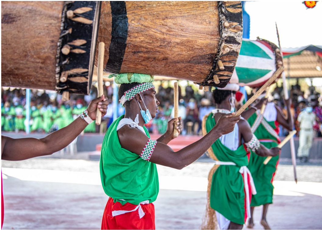
Burundian dancers perform during the sixth edition of Turkana's Tourism and Cultural Festival – Tobong'u Lore.