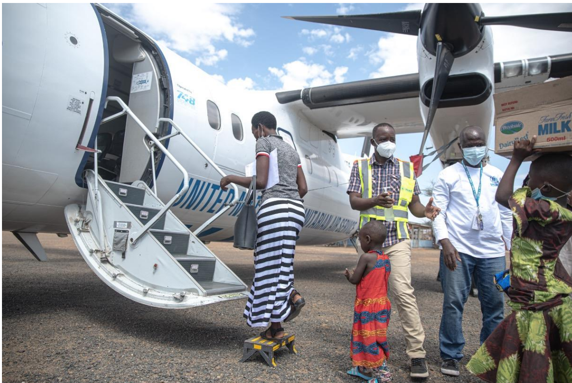
Burundian refugees board a plane to take them home from Kakuma Refugee Camp.