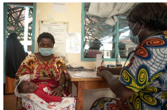
A Refugee mother from Congo at the Locher Angamor Antenatal Clinic in Kakuma Refugee Camp. In October 468, skilled deliveries were recorded within various health facilities in Kakuma and Kalobeyei

Cumulative number of registered people since January.