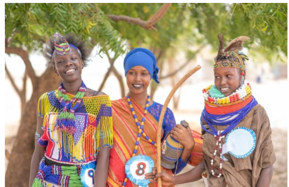
Learners from LifeWorks Boarding school display their traditional attire during a cultural day held at the school.

Cumulative number of Individuals were registered since January