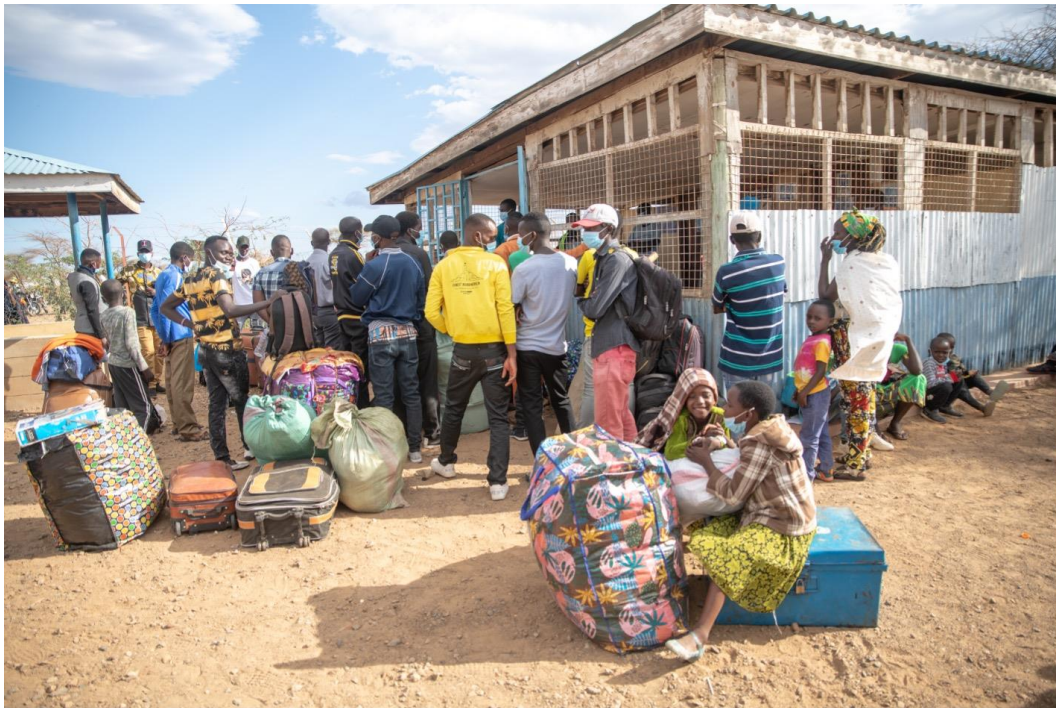
Burundian refugees queuing to check-in at the Kakuma Airstrip. Plane that will be taking them home to Burundi from Kakuma Refugee Camp.