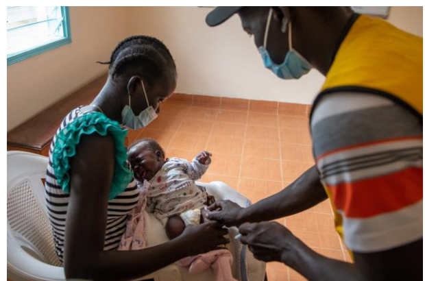
A toddler receives a shot of vaccine at the locher Ang'amor health facility in Kakuma camp. The Government of Kenya launched a measles vaccination campaign targeting children aged 9-59 months in Kakuma and Kalobeyei.

refugees departed to various resettlement countries since January 2021.