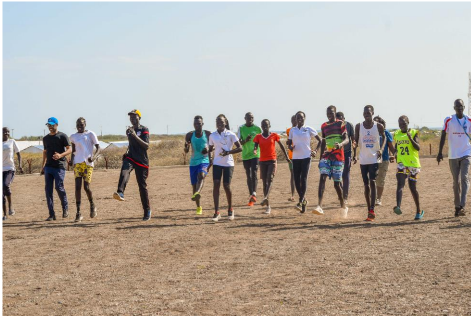
The Head of UNHCR Kakuma Sub-Office joins the Refugee Olympic Team athletes and other young athletes during a training session at the Olympic Stadium in Kalobeyei settlement.