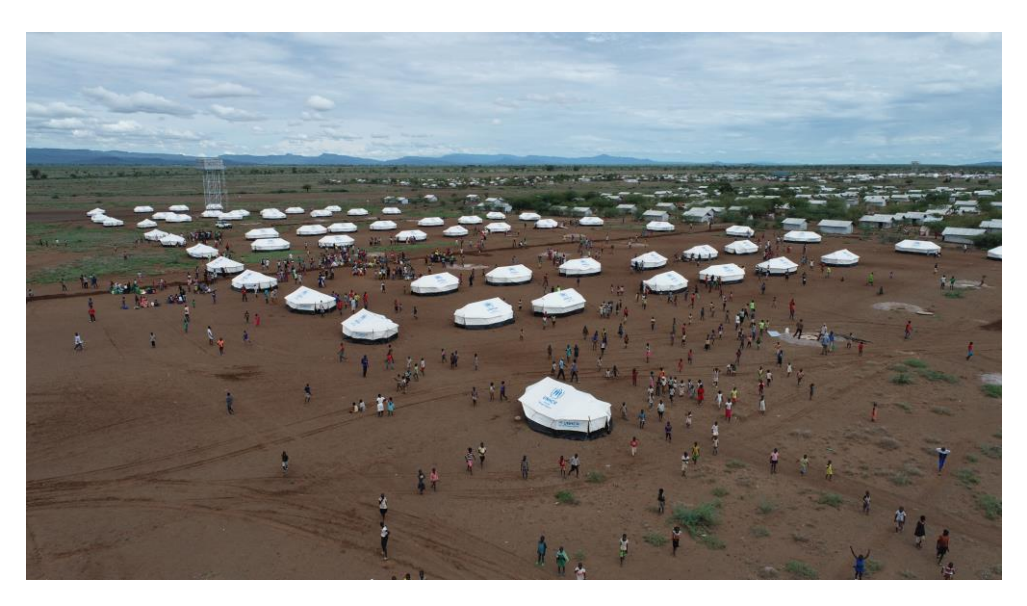
Aerial image of family tents set up at Kalobeyei village 3 for flood affected families relocated from Kakuma refugee camp.