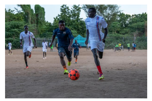
Kakuma refugee football teams play a friendly match while donning jerseys they received from UC Sampdoria, Italian professional Football Club.

Refugees vaccinated in Kakuma camp and Kalobeyei settlement