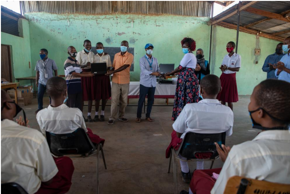
UNHCR's Head of Sub Office and the Sub County Director for Education, Turkana West Sub County, hands over ICT equipment to teachers and girls from Our Lady's Girls Secondary School in Kakuma town.