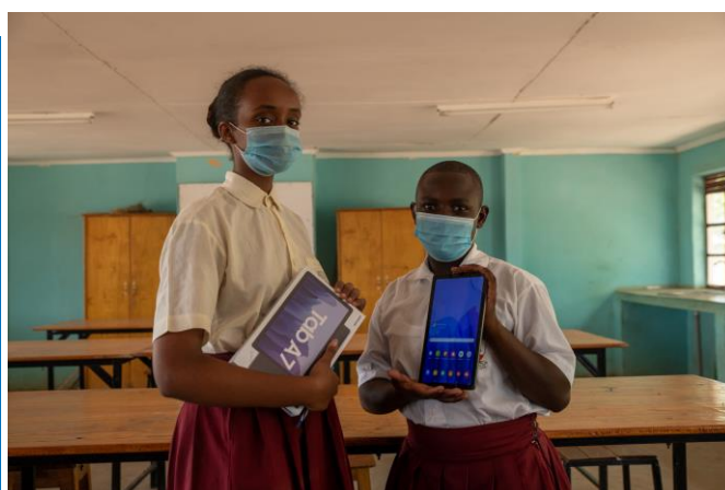
Learners (refugee and host) at Our Lady secondary school pose with tablets donated to the school by various donors through UNHCR.