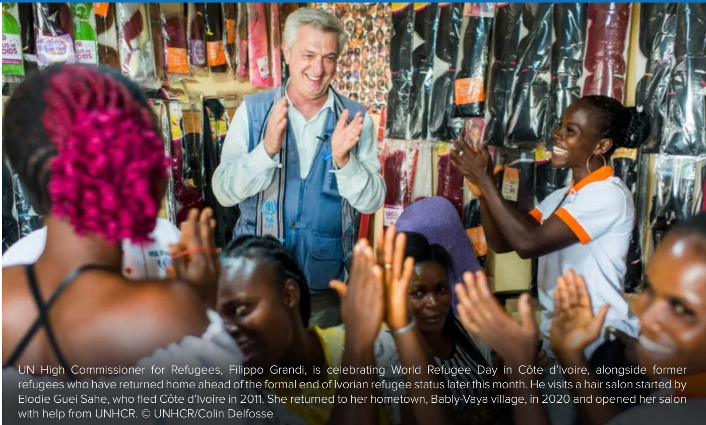
UN High Commissioner for Refugees, Filippo Grandi, is celebrating World Refugee Day in Côte d'Ivoire, alongside former refugees who have returned home ahead of the formal end of Ivorian refugee status later this month. He visits a hair salon started by Elodie Guei Sahe, who fled Côte d'Ivoire in 2011. She returned to her hometown, Bably-Vaya village, in 2020 and opened her salon with help from UNHCR.