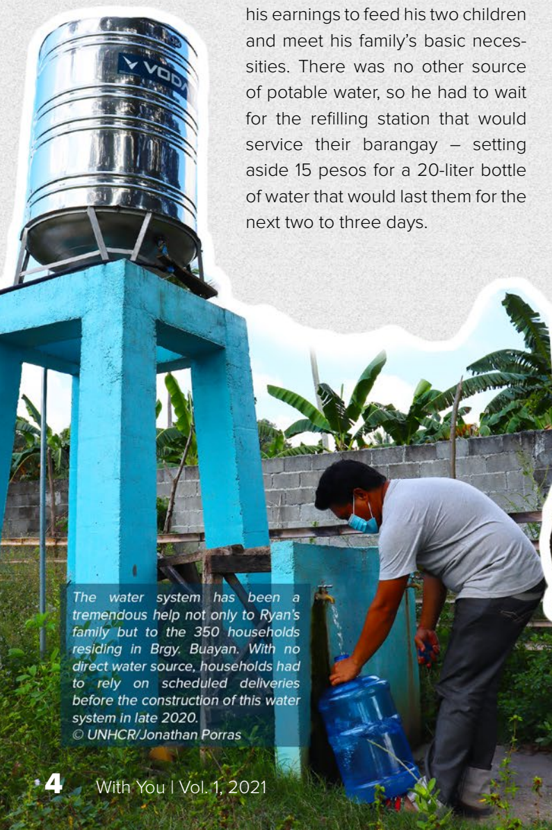
The water system has been a tremendous help not only to Ryan's family but to the 350 households residing in Brgy. Buayan. With no direct water source, households had to rely on scheduled deliveries before the construction of this water system in late 2020.

Despite its capacity to host forcibly displaced families, Brgy. Buayan has limited resources to provide for the basic needs of the caseload IDPs like Ryan's family. As Ryan has experienced, restrictions on mobility have hampered access to livelihood opportunities and critical services.