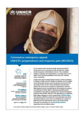
Global Focus COVID-19 Situation page (including UNHCR's COVID emergency appeal and sitreps)