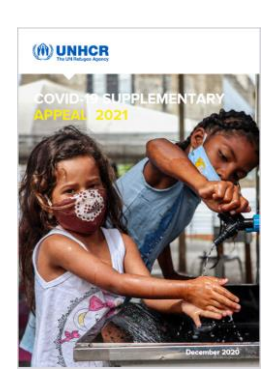
UNHCR COVID-19 Supplementary Appeal 2021 (launched 18 December 2020)