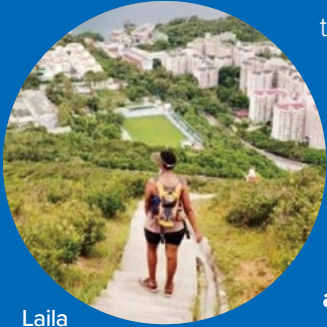
Laila 來自東非的難民 A refugee from East Africa

Today, as we commemorate seven decades of standing with refugees, we've reached a major milestone. It couldn't have happened without you.