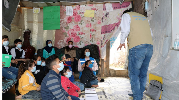
Homework support class in an informal settlement runs by an ECL Akkar, northern Lebanon.