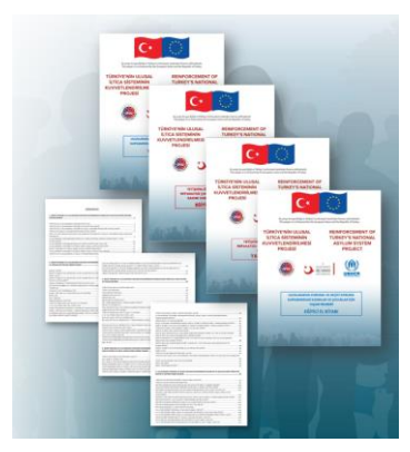
Modules and training guides for the orientation of refugee women and children and the transition of UASC within Turkish society.

Programme modules in the form of guides and training-of-trainer manuals were developed and printed to be distributed to PDMMs and relevant institutions. Several documents were also produced for women