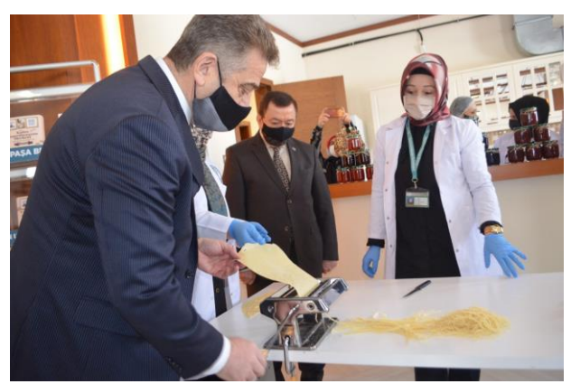
The launch event of the innovative and entrepreneurial project for refugee and Turkish women in collaboration with Gaziosmanpaşa municipality and WALD Academy.

Izmir Metropolitan Municipality developed a Guide for Municipal Staff on Refugees and a Multi-Lingual City Guide for Refugees and Foreigners through its cooperation with UNHCR in 2020. UNHCR is currently reviewing the documents and their translations into five languages. The Guide for Municipal Staff on Refugees aims to increase the awareness of municipal staff regarding International and Temporary Protection legislation and available services and referral mechanisms for International and Temporary Protection holders and applicants. The Multi-Lingual City Guide for Refugees and Foreigners includes information on city and municipal services, with feedback from refugee communities, and will be a living document to be published online and regularly updated. Printed materials will also be distributed to district municipalities and other relevant institutions to serve as a tool to advocate for inclusive service provision for refugees.