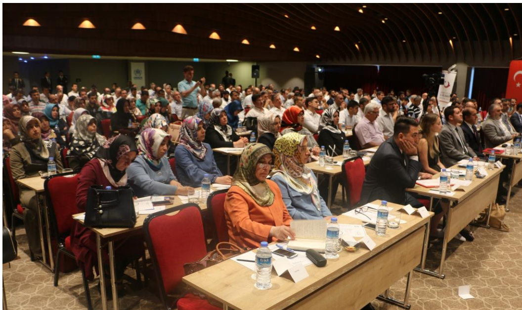
Social Cohesion workshop held in Adana in cooperation with Diyanet and Ministry of National Education.

As of end of September, close to 12,900 submissions for resettlement of refugee cases (68 per cent Syrian and 32 per cent refugees of other nationalities) were made to 18 countries. Over 9,300 refugees departed for resettlement (79 per cent of them Syrian). Furthermore, UNHCR organised a training on resettlement for UNHCR staff in South East Turkey and partner agencies and organisations including AAR Japan, ASAM, DRC, IBC, WHH and IOM on 13 September. The training focused on resettlement procedures, selection criteria and quotas.