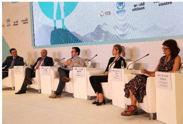
University academics provide insights into the needs of students under international protection and the role of higher education in fostering social cohesion.

On 30 July, a Conference on Higher Education for Students under International Protection was organized with the collaboration of YTB, UNHCR Turkey, TRT World Research Centre, and TRT World Citizen. The conference focused on the experiences of students under international protection in Turkey. Around 150 people attended the conference, and welcoming speeches were delivered by UNHCR Representative, YTB President, Chief Editor of TRT World, and the Co-Chair of UNHCR’s Global Youth Advisory Council. The conference was an opportunity for major actors in the field to outline their ongoing work and perspectives on supporting higher education for students under international protection. University academics provided insight into student needs, the role of higher education in fostering social cohesion, and discussed opportunities for a more effective collaboration between higher education institutions.