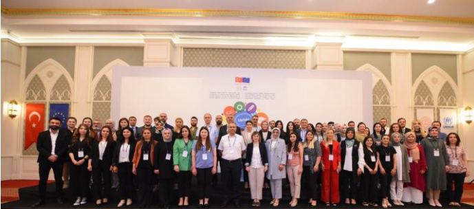
Participants of the training on teaching methods for teachers and PEC managers which took place in June.

In July, at the Human Rights Academy on International Protection and Refugees international summer school in Çeşme organized by the Friedrich Naumann Foundation for Freedom, UNHCR gave a presentation on the principle of non-refoulement in the international and national legal framework. The summer school included participants from Türkiye, Syria, Lebanon, Poland, Spain, Italy, Hungary, Georgia and Bulgaria. UNHCR's spokesperson also gave a presentation on the Global Compact on Refugees and Refugee Response.