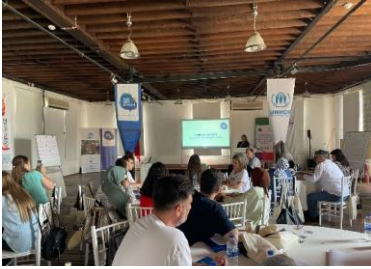
Refugee-led organizations and committees in Izmir increase their advocacy skills.

Another training was organized in Antalya for 100 social workers serving in child protection mobile teams from 71 provinces at the Ministry of Family and Social Services' Directorate General of Child Services. The training was held 14-17 June and included sessions on risk factors for families and children, working with trauma and crisis, social services provided to foreigners in Türkiye, case management, psychosocial support, family visits, supervision, self-care, and other aspects.