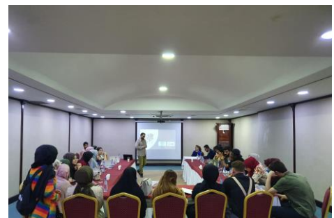
Students at Harran University in Sanliurfa receive problem solving and conflict resolution skills training.

In May and June, UNHCR and YTB facilitated various trainings on problem solving and conflict resolution across Türkiye. One training took place in collaboration with Necmettin Erbakan University, where around 100 students from host and refugee communities were trained on interactive social problem solving and conflict resolution techniques. On 28-29 May, another training was organized for students and academics of Harran University in Şanlıurfa to promote the role of youth as agents of change in their communities.