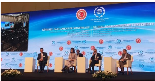
UNHCR Representative participates in a panel discussion on global compacts and policies during the conference on parliaments and global compacts in Istanbul.

In cooperation with the Global Compact on Refugees team at headquarters, UNHCR participated in the conference on Parliaments and the Global Compacts on Migration and Refugees organized by the Interparliamentary Union (IPU) and the Grand National Assembly of Türkiye (GNAT) on 20-21 June with a focus on bringing about stronger international cooperation and national implementation. The Speaker of the GNAT, Mustafa Şentop, mentioned in a news conference, that bringing together parliamentarians to discuss and look at possible solutions would help to raise more awareness on global migration, stressing that solutions should be as global as the problem is. Around 300 parliamentarians and officials from 50 different parliaments, including 16 speakers and deputy speakers and senior Turkish officials attended the event. UNHCR's Türkiye