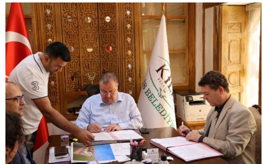
UNHCR and Kilis Municipality sign a Letter of Understanding in Kilis.

The Representative was on mission to the southeast region of Türkiye , in Kilis, Gaziantep, Mardin and Şanlıurfa during the first week of July. In addition to meeting governors, provincial directors of migration management, mayors, and visiting verification and voluntary repatriation processing areas, the Representative also met with staff, partners, and university representatives, and visited livelihoods and social cohesion projects implemented by UNHCR and partners. The Representative also signed a Letter of Understanding with the Mayor of Kilis to strengthen the ongoing partnership between UNHCR and Kilis Municipality for the protection and provision of services to people in need of international protection in Kilis and to support social cohesion among the communities. Kilis is the province in Türkiye with the highest proportion of Syrians to the Turkish population.