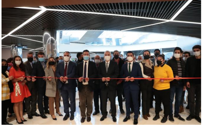
Representatives from Denizli Metropolitan University and UNHCR inaugurate the Denizli Youth Academy