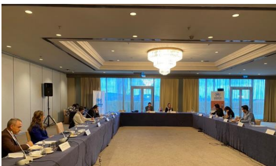
Roundtable with UNHCR, private sector representatives and Istanbul Metropolitan Municipality Lifelong Learning Directorate to discuss challenges to refugees' access to the labour market and areas of collaboration

On 19 October, the Representative participated in a roundtable with private sector representatives to discuss their role in refugees' access to the labour market, challenges and needs in refugee employment and to identify areas of potential collaboration for the future. Representatives from H&M, Inditex, Al-Baraka Turk Bank, Unlü Textile, Turkish American Businessmen Association (TABA) and Istanbul Metropolitan Municipality Art and Vocational Training Courses (ISMEK) and regional employment offices participated in the meeting. The participating companies employ refugees in their supply chains and work towards achieving social compliance in their workplaces. UNHCR works with the invited companies and institutions at different levels varying from vocational training projects to information-sharing meetings and support for work permit procedures.