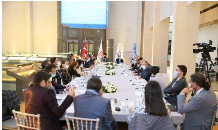
Members of the Chambers of Commerce, Industry and Agriculture and officials of public institutions and NGOs discuss refugees' access to the labour market through an initiative of Abdullah Gül University.