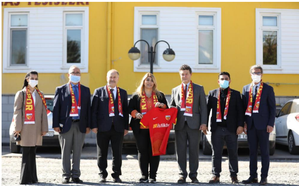
UNHCR visits Kayseri Football Club and is given a guided tour by its CEO

The World Bank in Turkey and UNHCR held the fourth and last roundtable for 2021 as part of the Platform on Social Enterprises and Cooperatives, with 46 national policy makers at ministries, chambers of commerce and municipalities. The platform discussed the role of national institutions in strengthening social enterprises and possible cooperation areas.