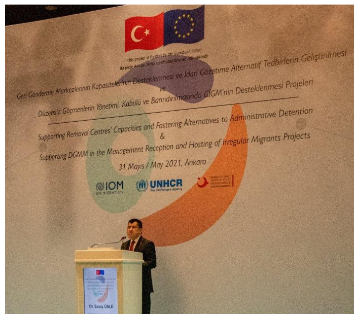
Speeches delivered at the opening ceremony of the two projects: Supporting Removal Centres' Capacities and Fostering Alternatives to Administrative Detention and Supporting DGMM in the Management, Reception and Hosting of Irregular Migrants funded by the European Union.