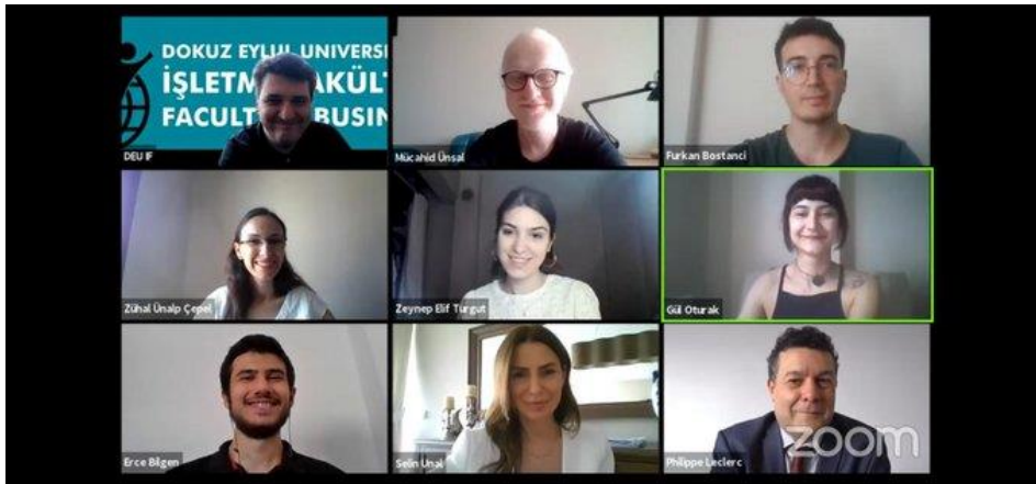
UNHCR Representatives and students of DEU Faculty of Business in an online discussion on protection and asylum.