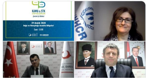
Screenshots from the final Regional NGO Meeting held with participants DGMM, UNHCR and civil society participants from Eastern and South East Anatolia

Regional meetings with NGOs on social cohesion were organised by UNHCR in December as part of the UNHCR-DGMM Joint Harmonization Initiative. Five meetings covering six geographical regions of Turkey, including the Aegean, Marmara, Central Anatolia, Mediterranean and South East Turkey and Eastern Anatolia were held thus reaching a total of 260 representatives from 167 NGOs. The first of these meetings had taken place for the Black Sea region on 30 November. The purpose of the meetings was to encourage cooperation between the public sector and civil society, to identify gaps and good practices, raise awareness on harmonization policies and practices, and to facilitate the inclusion of civil society in policy-making processes related to social cohesion. Overall, the meetings facilitated a rich exchange of views between NGOs and public institutions. A high-level participation from the Directorate General of Migration Management (DGMM), as well as the Ministry of Interior, the Ministry of Family, Labour and Social Services, the Ministry of National Education, the Disaster and Emergency Management Presidency (AFAD), and the Turkish Red Crescent contributed to the meetings with valuable insights. UNHCR and DGMM will continue to engage with NGOs on social cohesion to facilitate their involvement in social cohesion activities at the regional and provincial levels.