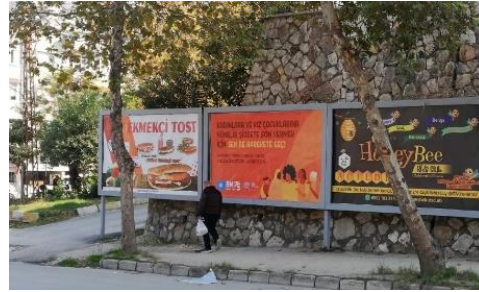
Billboards of the 16 Days of Activism Campaign were placed in different areas across South East Turkey