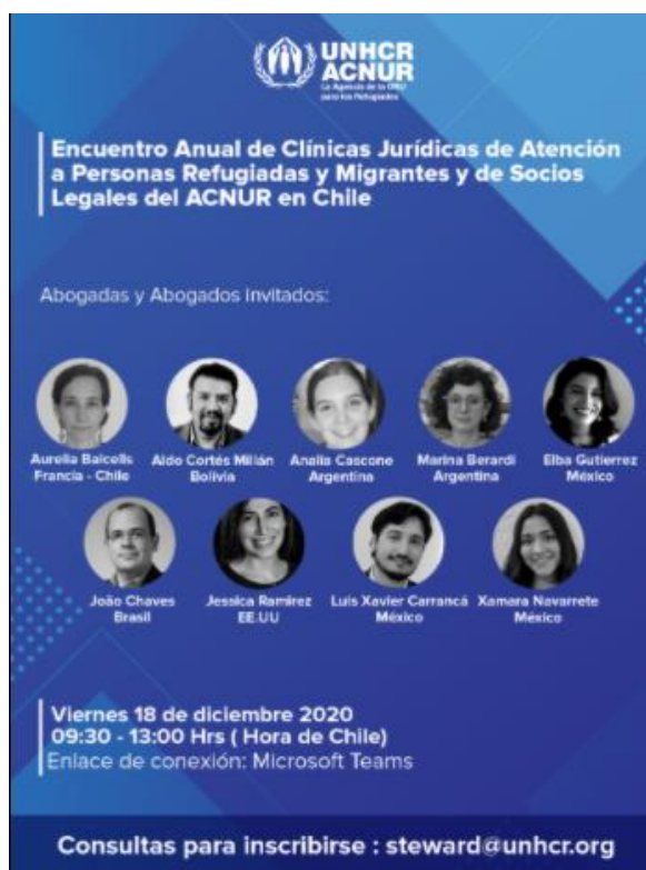
Poster of the activity © UNHCR, December 2020.