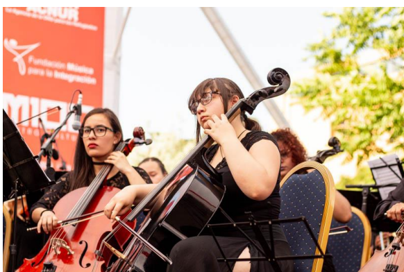
Music for Integration Symphonic Orchestra on a free Concert organized jointly with UNHCR.

“Música para la Integración” Foundation is a civil society organization that was created to rescue the musical talent of hundreds of refugees and migrants living in Chile. The Foundation has a Symphonic Orchestra that performs in free shows as a way to promote cultural spaces in the city, and also has a low-cost school in which foreign professional musicians teach music to more than 300 boys and girls of various ages and nationalities (97 per cent of them are refugees and migrants).