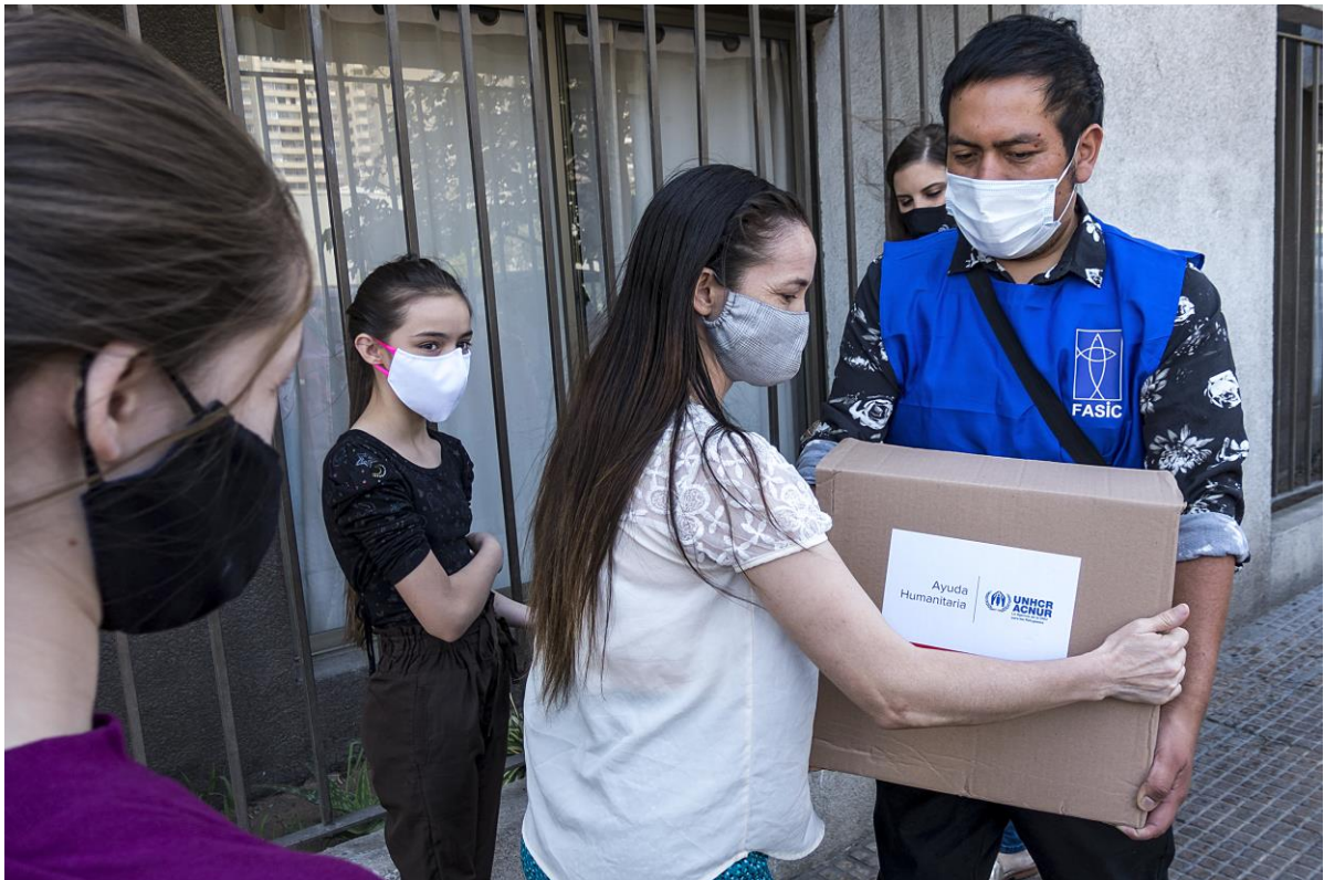
Asylum-seeker woman receives a food box distributed by UNHCR and its partner agency FASIC.

During the holiday season, our agency donated hundreds of toys and food boxes to refugees and migrants living in the cities of Santiago, Arica and Antofagasta