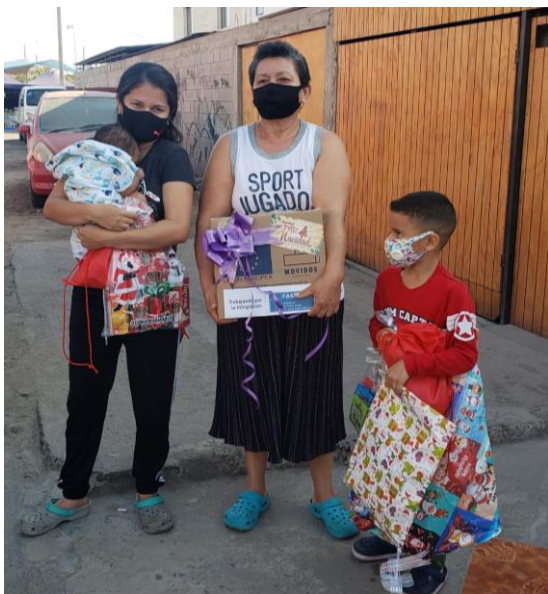
Family receiving gifts and sweets bags in Arica, December 2020.