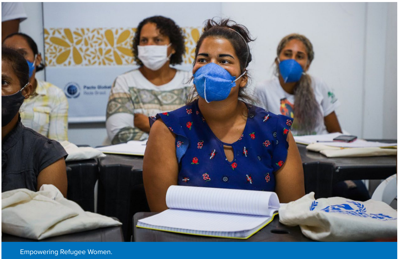
Empowering Refugee Women.